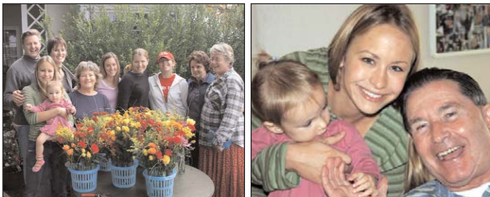
Volunteers from Hope for Long Beach deliver flowers to multiple sclerosis patients four times a year.

The Idea: To empower children to reach out to their communities. Create a kid-powered ministry with kids planning and carrying out quarterly service projects to support the local community. ( www.marinerslighthouse.org )