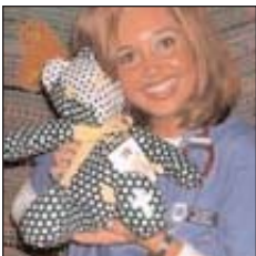
Handmade bears from Irving Bible Church give comfort to cancer patients worldwide.

The Idea: To show worldwide compassion to children living with cancer by creating and delivering handmade teddy bears. An Irving Bible Church "Bear Ministry" was started in 2003. Handmade, stuffed bears are created and distributed to those suffering from cancer all over the world. The ministry has delivered over 350 bears to date and is well on the way to delivering a donation to St. Jude Children's Hospital. ( www.irvingbible.org )