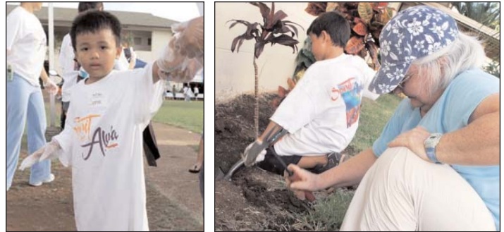
Volunteers both young and old came together for a common cause on National Make a Difference Day.

with 5,000 participating in the closing ceremonies. ( www.mykidsgames.com ) ( www.northlandcc.net )