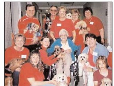
Even pets can be involved in service opportunities, as members of Northland, A Church Distributed demonstrate.

( www.northlandcc.net/ministries/community_care/community_care.htm )